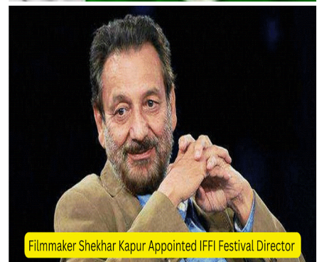
Filmmaker Shekhar Kapur Appointed IFFI Festival Director

(A) Recently, Indian filmmaker Shekhar Kapur has been appointed as the festival director for the India International Film Festival to be held in Goa. The Ministry of Information and Broadcasting has given this information by sharing a post on social media. Along with this, it has also been mentioned in the notification that he is going to lead this festival.